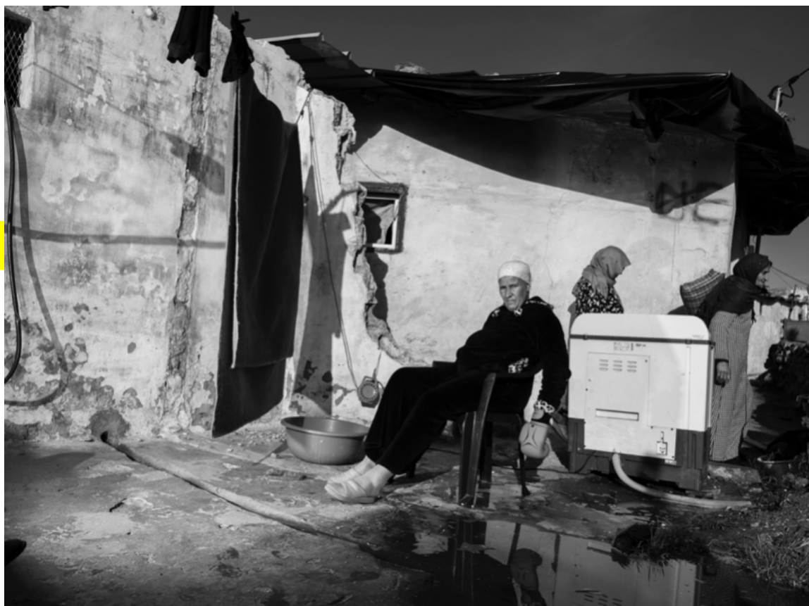
Mera O Ness